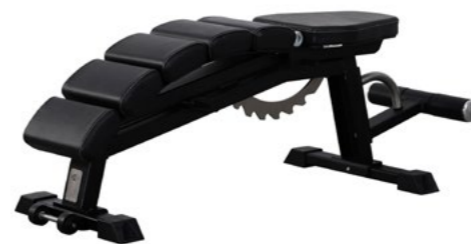
Adjustable Decline Bench Curved Art.nr: 193S

Length: 133 cm Width: 45 cm Height: 42 - 115 cm