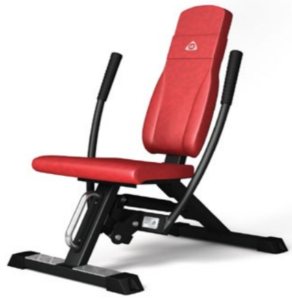
Chest Press / Back Art.nr: 921

Length: 113 cm Width: 69 cm Height: 115 cm Weight: 45 kg