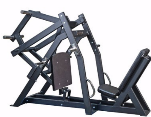
Leg Press Art.nr: 043

Length: 226 cm Width: 120 cm Height: 138 cm