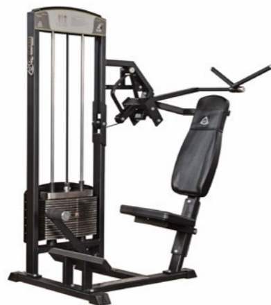
Pullover Art.nr: 324

Length: 143 cm Width: 89 cm Height: 172 cm