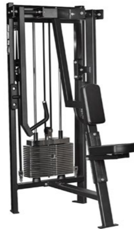
Iso Lateral Low Row Art.nr: 312

Length: 121 cm Width: 81 cm Height: 166 cm