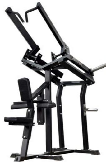
Iso Lateral Pulldown Art.nr: 011

Length: 156 cm Width: 104 cm Height: 199 cm