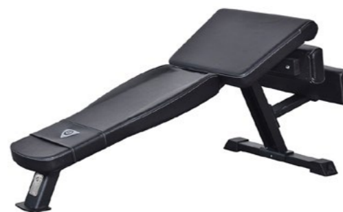
Fixed Decline Bench Art.nr: 194

Length: 148 cm Width: 60 cm Height: 60 cm