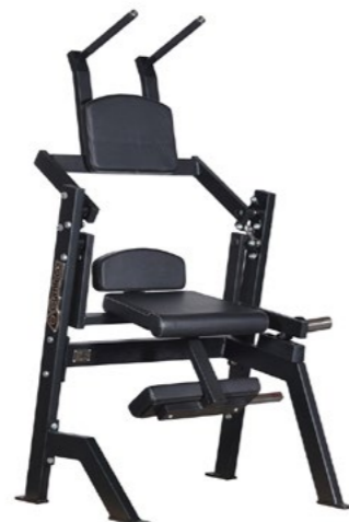
Seated Abdominal Art.nr: 070

Length: 83 cm Width: 114 cm Height: 168 cm