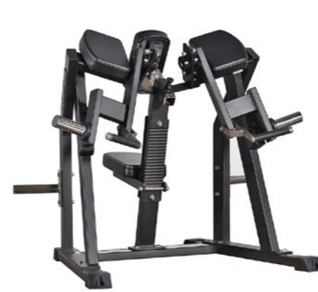
Biceps curl machine Art.nr: 050

Length: 104 cm Width: 120 cm Height: 103 cm