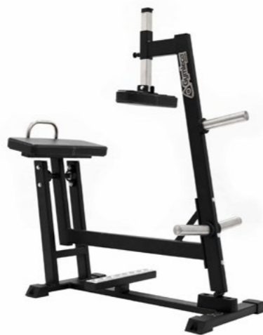
Donkey Raise Art.nr: 046

Length: 120 cm Width: 60 cm Height: 150 cm