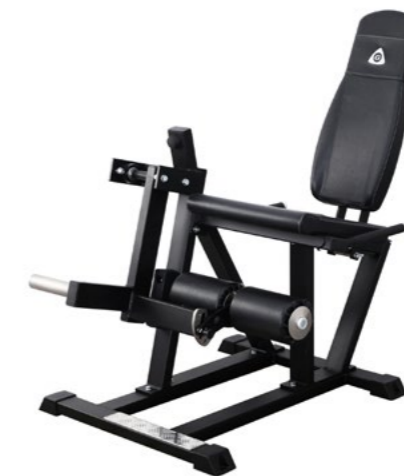
Leg Extension Art.nr: 040

Weight: 125 kg Start weight handles: 21 kg