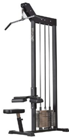
Lateral Pulldown Rehab Art.nr: 211R

Length: 124 cm Width: 52 cm Height: 226 cm