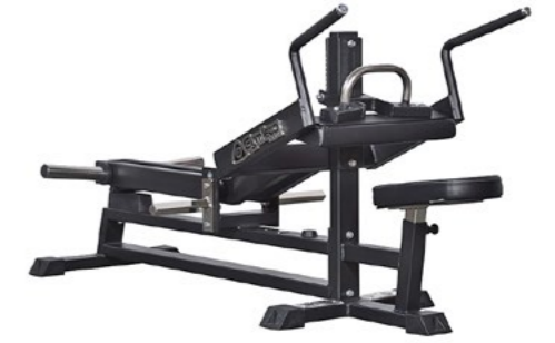
Dip Press Art.nr: 055

Length: 190 cm Width: 70 cm Height: 90 cm