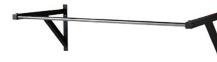
Wallmounted Pull-up Rack Art.nr: 110V

Length: 145 cm Width: 61,5 cm Height: 42 cm