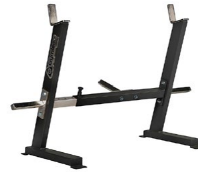
Curl Bar Rack Art.nr: 150

Length: 70 cm Width: 95 cm Height: 86,5 cm