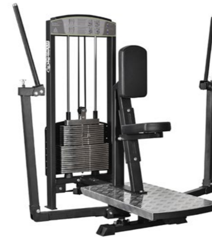
Rear Deltoid/Pec Deck Art.nr: 335

Length: 147 cm Width: 70 - 174 cm Height: 149 cm