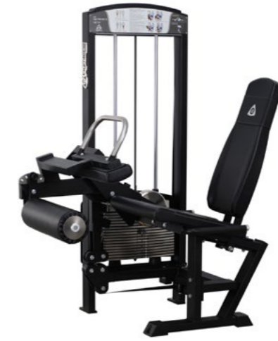
Leg Extension / Leg Curl Art.nr: 349

Length: 115 cm Width: 99 cm Height: 163 cm