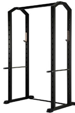
Power Rack Art.nr: 149

Length: 90 cm Width: 122 cm Height: 205 cm