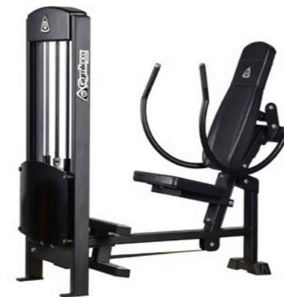
Triceps Extension Art.nr: 351

Length: 136 cm Width: 67,5 cm Height: 134 cm