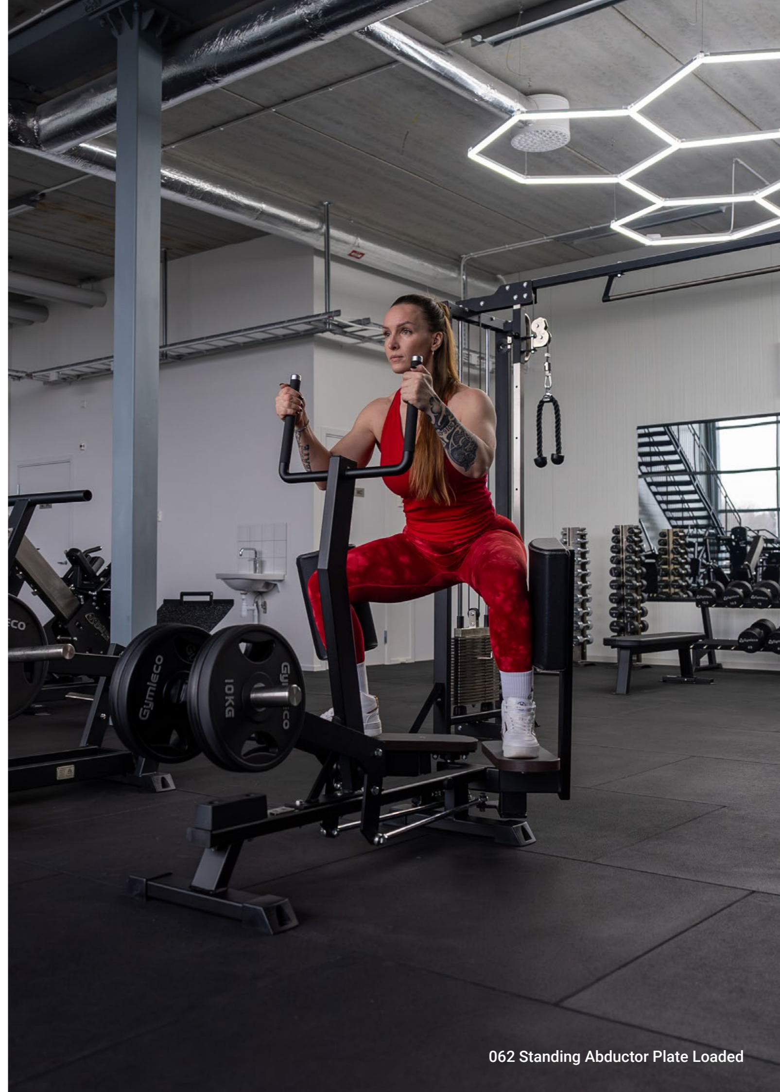
062 Standing Abductor Plate Loaded