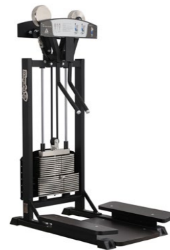
Standing Side Lateral Art.nr: 334

Length: 116 cm Width: 82 cm Height: 160 cm