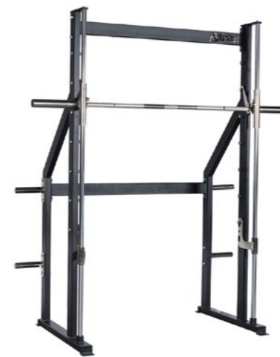
Smith Machine Art.nr: 280

Length: 195 cm Width: 90 cm Height: 207 cm