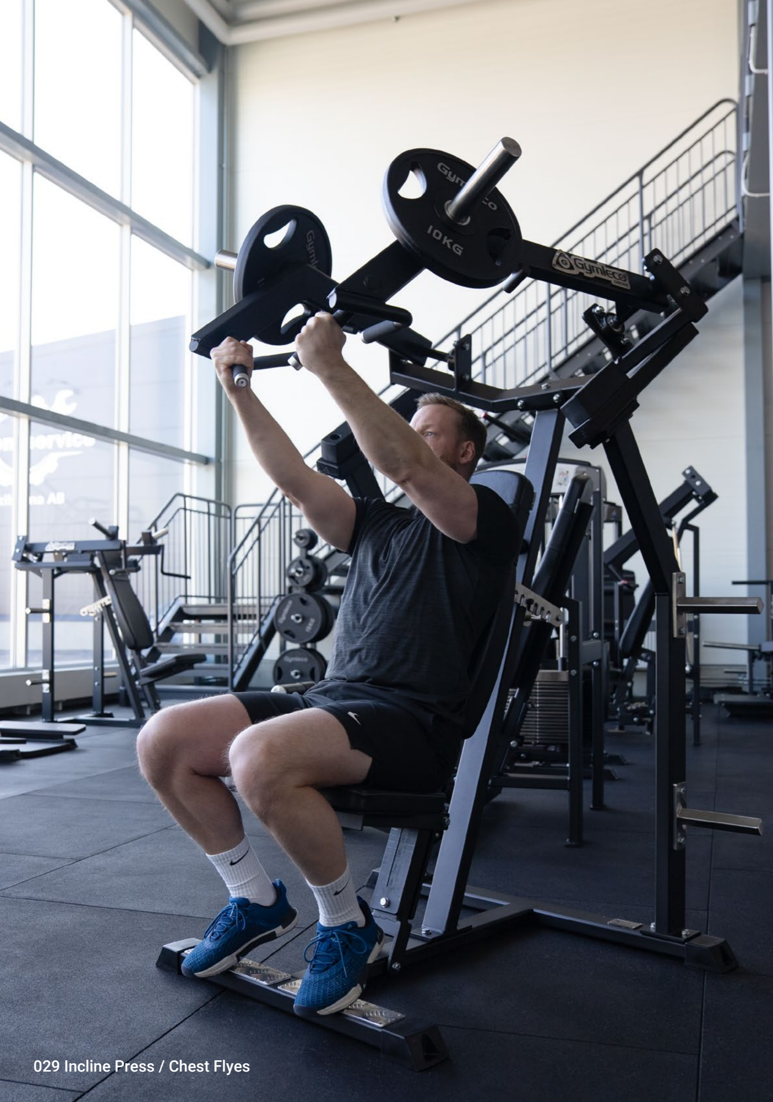
029 Incline Press / Chest Flies