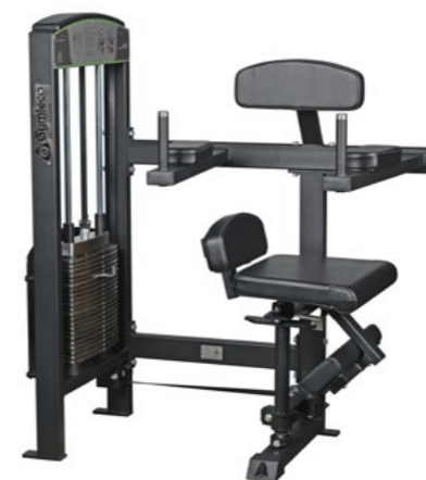
Torso Rotation Art.nr: 375

Length: 120 cm Width: 75 cm Height: 139 cm