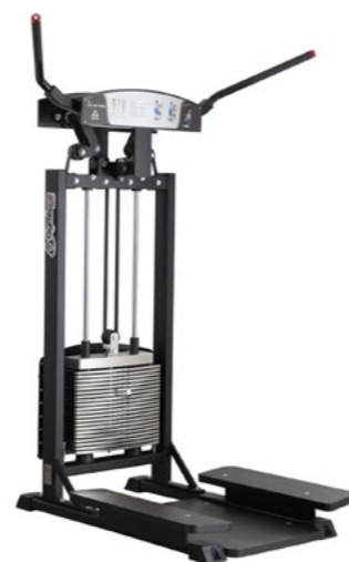
Standing Pec Fly Art.nr: 326

Length: 116 cm Width: 148 cm (widest point) Height: 178 cm