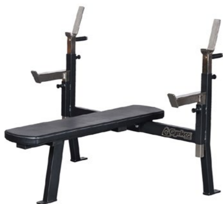
Bench Press with Safety Bar Support Art.nr: 122RS

Length: 125 cm Width: 124 cm Height: 104 cm