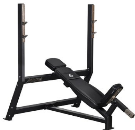
Incline Bench Press Art.nr: 120

Length: 125 cm Width: 150 cm Height: 124 cm