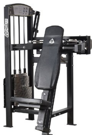
Shoulder Press Art.nr: 330

Length: 155 cm Width: 125 cm Height: 165 cm