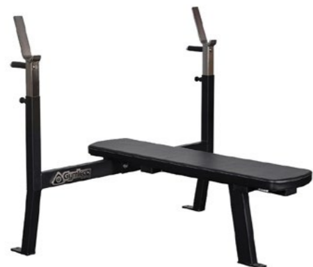
Bench Press Stand with Adjustable Bar Holder Art.nr: 122R

Length: 125 cm Width: 124 cm Height: 104 cm