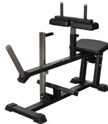
Seated Calf Press Art.nr: 145

Length: 140 cm Width: 60 cm Height: 85 cm