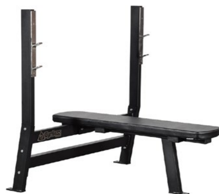
Bench Press with Fixed Bar Holder Art.nr: 122F

Length: 123 cm Width: 123 cm Height: 124 cm