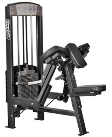
Biceps Curl machine Art.nr: 350

Length: 100 cm Width: 95 cm Height: 153 cm