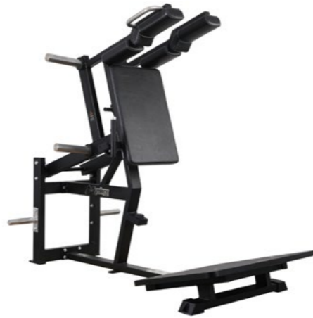
V-Squat Art.nr: 044

Length: 171 cm Width: 87 cm Height: 191 cm