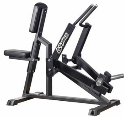
Iso Lateral Seated Row Art.nr: 010

Length: 150 cm Width: 71 cm Height: 120 cm