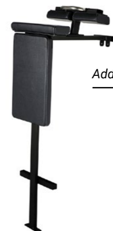
Brutal Bench Art.nr: 174

Length: 75 cm Width: 50 cm Height: 160 cm