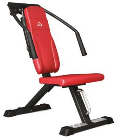
Pulldown / Shoulder Press Art.nr: 911

Length: 113 cm Width: 69 cm Height: 115 cm Weight: 45 kg