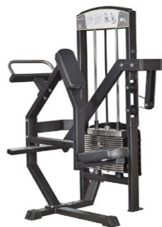
Gluteus, One Leg kick Art.nr: 360

Length: 86 cm Width: 75 cm Height: 136 cm