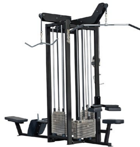
Four Station Multi Gym Art.nr: 215

Length: 112 cm Weight: 168,5kg Width: 141 - 212 cm Weight Stack: 100 kg Height: 223 cm