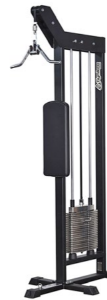
Triceps Pushdown Art.nr: 251

Length: 490 cm Cable Cross: 80 kg x2 Width: 323 cm Row: 120 kg x2 Height: 235,5 cm Pulldown: 120 kg x2 Weight N.W: 1347 kg Triceps: 60 kg x2