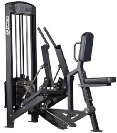
Seated Row Art.nr: 310

Length: 151 cm Width: 63 cm Height: 165 cm