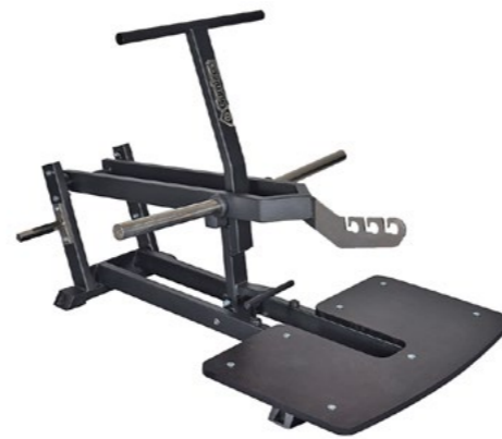
Belt Squat machine Art.nr: 082

Length: 170 cm Width: 116 cm Height: 112 cm