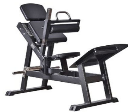
Hip Thrust machine Art.nr: 066

Length: 160 cm Width: 96 cm Height: 124 cm