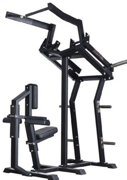
Iso Lateral High Row Art.nr: 013

Length: 160 cm Width: 110 cm Height: 198 cm