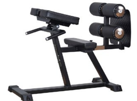
Glute Ham Raise Art.nr: 141

Length: 110 cm Width: 60 cm Height: 90 cm