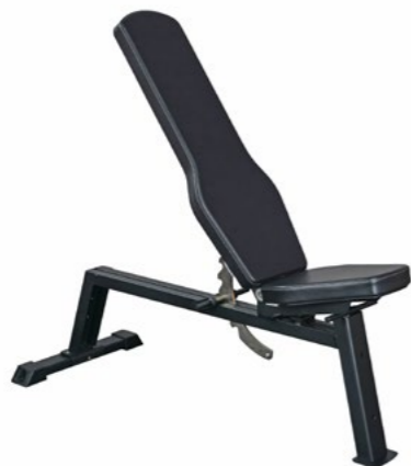
Adjustable Gym Bench Art.nr: 190

Length: 125 cm Width: 45 cm Height: 43,5 cm