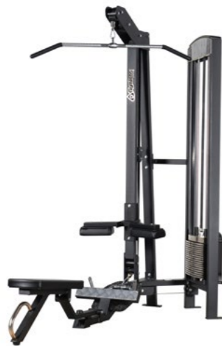
Lateral Pulldown/Seated Row Art.nr: 214

Length: 112 cm Weight: 168,5kg Width: 141 - 212 cm Weight Stack: 100 kg Height: 223 cm