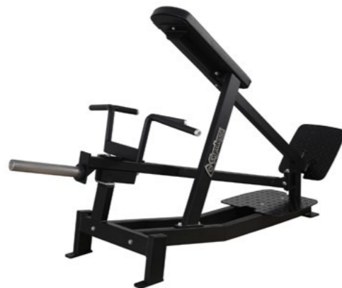
Incline T-bar row Art.nr: 116

Length: 195–212 cm Width: 92 cm Height: 109 cm