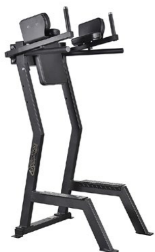
Leglift with Dip Bar Art.nr: 173

Length: 70 cm Width: 91 cm Height: 143 cm