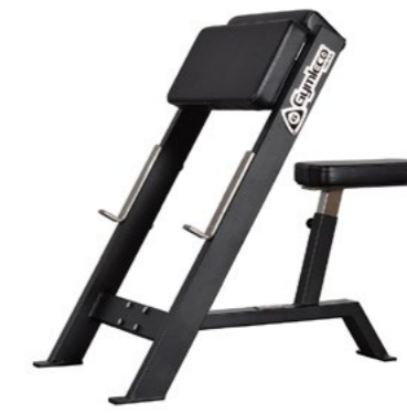
Seated Scott Curl Bench Art.nr: 151

Length: 101 cm Width: 70 cm Height: 95 cm