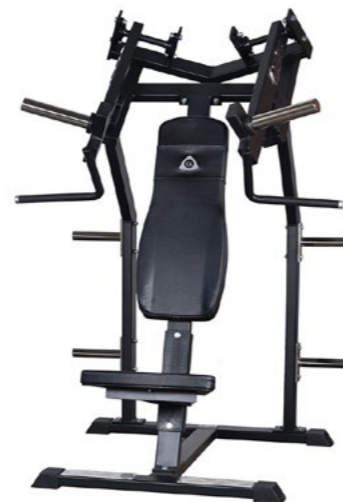
Lateral Incline Bench Press Art.nr: 020

Length: 110 cm Width: 113 cm Height: 177 cm