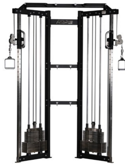
Dual Adjustable Pulley Art.nr: 226

Length: 151 cm Width: 77 cm Height: 228 cm