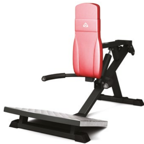
Squat / Hacklift Art.nr: 944

Length: 100 cm Width: 83 cm Height: 135 cm Weight: 46 kg