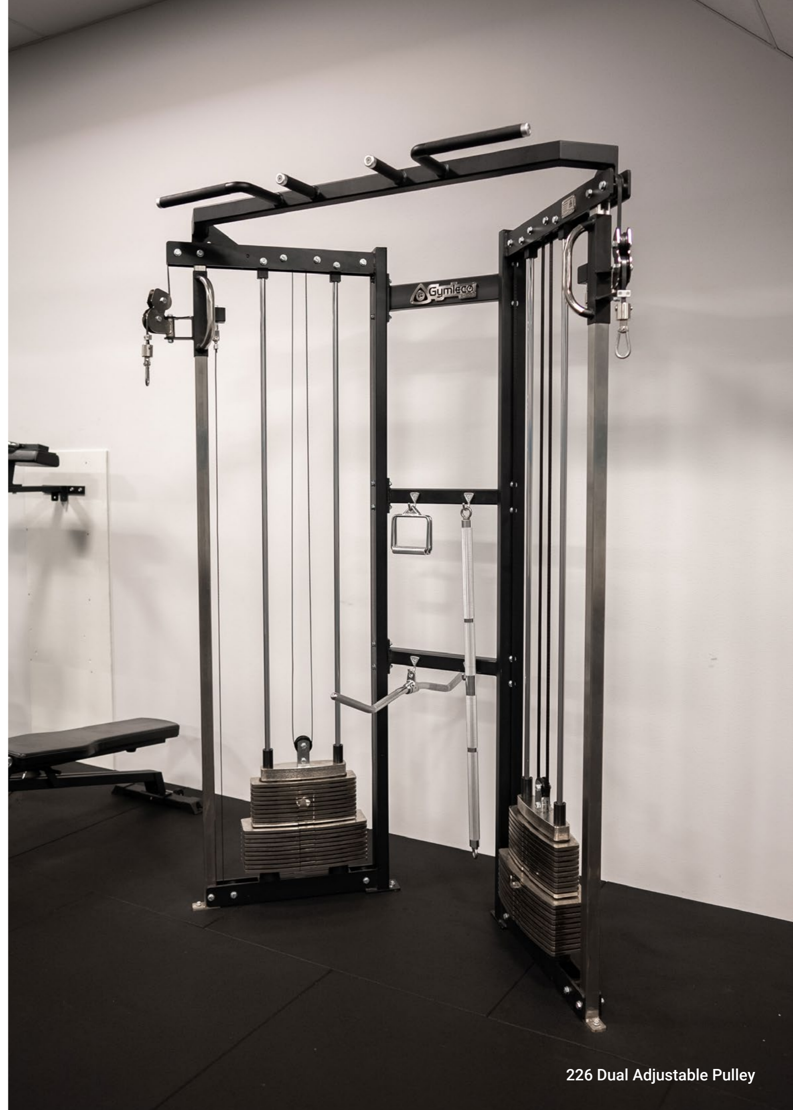
226 Dual Adjustable Pulley

Length: 323 cm Cable Cross: 80 kg Width: 53 cm Row: 120 kg Height: 235,5 cm Pulldown: 120 kg Weight N.W: 605 kg Triceps: 60 kg