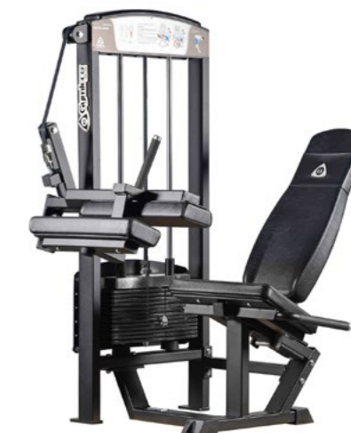
Seated Leg Curl Art.nr: 341

Length: 135 cm Width: 95 cm Height: 149 cm