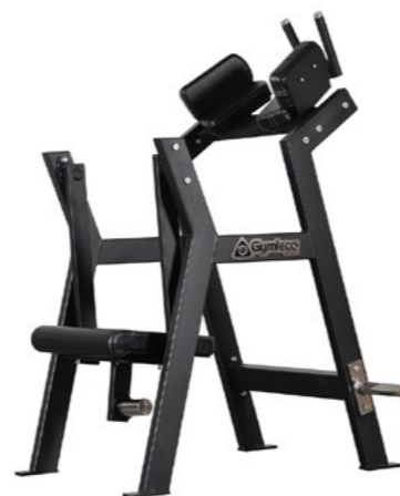
Ab Roll up Art.nr: 072

Length: 100 cm Width: 96 cm Height: 140 cm