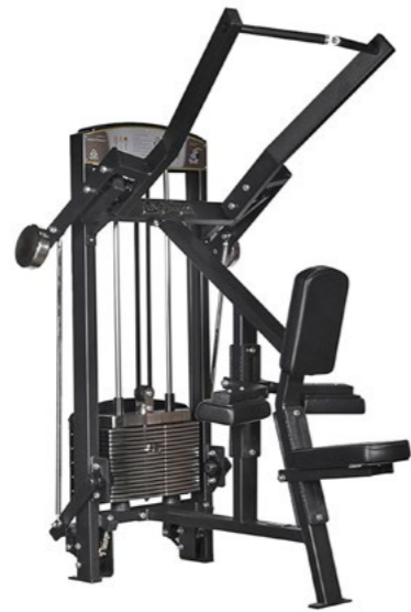
Iso Lateral Pulldown Art.nr: 311

Length: 126 cm Width: 95 cm Height: 186 cm