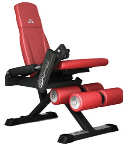
Leg Extension / Legcurl Art.nr: 949

Length: 173 cm Width: 86 cm Height: 107 cm Weight: 67 kg