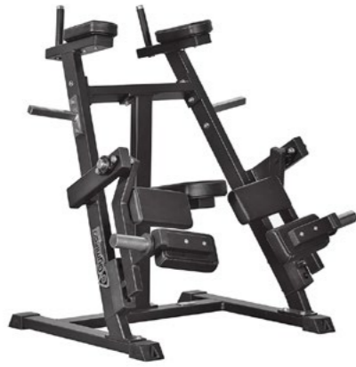
Standing Leg Curl Art.nr: 042

Length: 96 cm Width: 117 cm Height: 123 cm