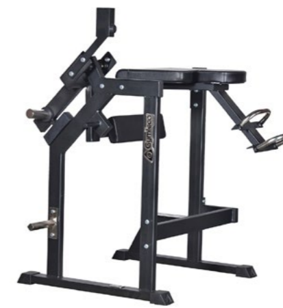
Reverse Hyper Art.nr: 061

Length: 116 cm Width: 140 cm Height: 144 cm