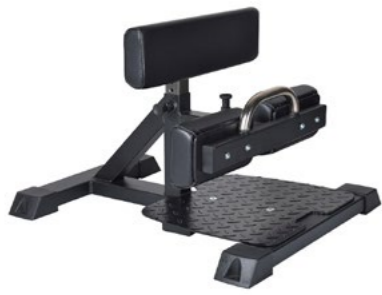
Sissy Squat Art.nr: 144

Length: 77 cm Width: 64 cm Height: 57 cm