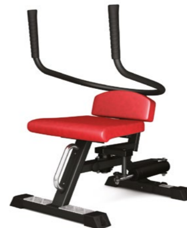
Waist Rotator Art.nr: 975

Length: 100 cm Width: 69 cm Height: 112 cm Weight: 45 kg