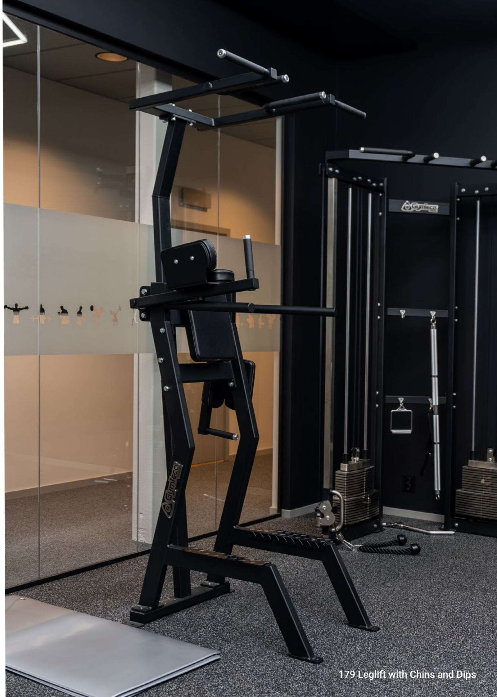
179 Leglift with Chins and Dips