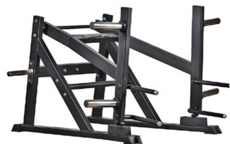
Deadlift / Squat Art.nr: 083

Length: 140 cm Width: 129,5 cm Height: 82 cm