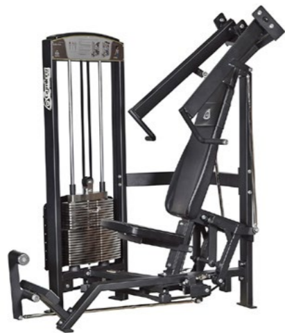
Incline Chest Press Art.nr: 320

Length: 156 cm Width: 122 cm Height: 173 cm