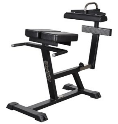
Back Raise 90 degrees Art.nr: 162F90

Length: 102 cm Width: 60 cm Height: 104 cm