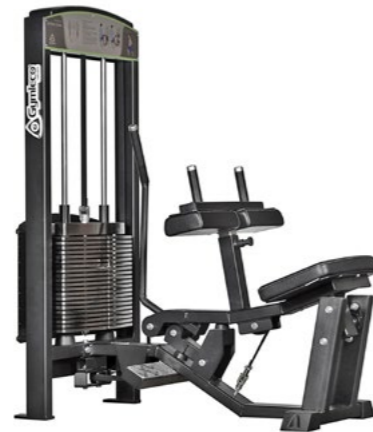
Seated Calf Press Art.nr: 345

Length: 120 cm Width: 60 cm Height: 140 cm