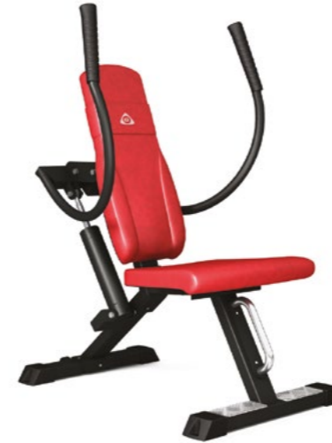
Biceps / Triceps Art.nr: 955

Length: 100 cm Width: 125 cm Height: 112 cm Weight: 50 kg