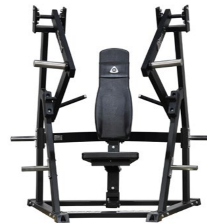
Decline Chest Press Art.nr: 027

Length: 120-133 cm Width: 144 cm Height: 158 cm