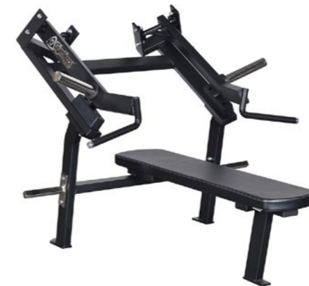
Iso Lateral Bench Press, Horizontal Art.nr: 022

Length: 163 cm Width: 133 cm Height: 114 cm