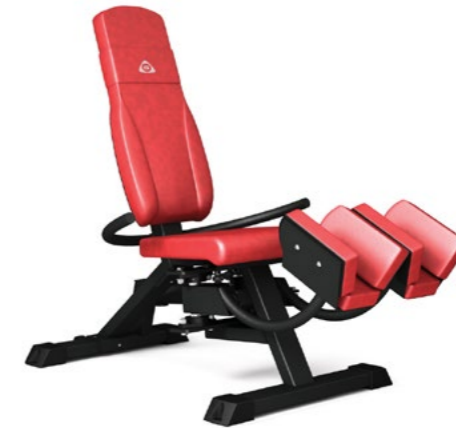
Adductor / Abductor Art.nr: 964

Length: 100 cm Width: 76 cm Height: 125 cm Weight: 45 kg