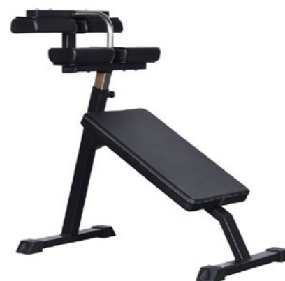
Abdominal Bench Plus Art.nr: 171

Length: 102 cm Width: 58 cm Height: 105 cm