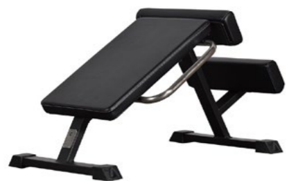
Roman Chair Art.nr: 170

Length: 102 cm Width: 58 cm Height: 57 cm