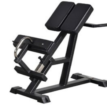
Back Raise 45 degrees Art.nr: 162F45

Length: 102 cm Width: 60 cm Height: 117 cm