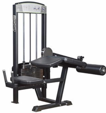
Lying Leg Curl Art.nr: 342

Length: 170 cm Width: 97 cm Height: 149 cm