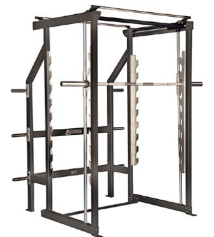
Multi Smith Machine Art.nr: 285

Length: 207 cm Width: 149 cm Height: 220 cm