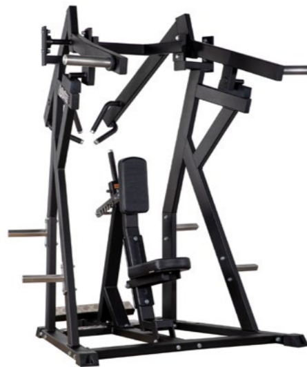
D.Y. Row Art.nr: 017

Length: 135 cm Width: 147 cm Height: 174 cm