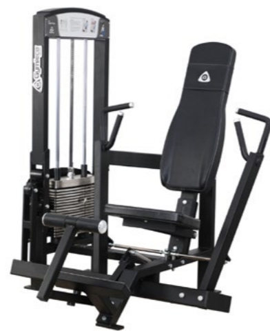
Seated Chest Press Art.nr: 321

Length: 139 cm Width: 137 cm Height: 149 cm