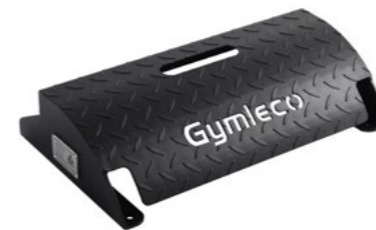
Calf Raise Block Art.nr: 146

Length: 51 cm Width: 30 cm Height: 12 cm