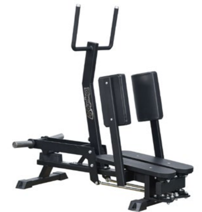
Standing Abductor Art.nr: 062

Length: 136,5 cm Width: 54 cm Height: 141,5cm