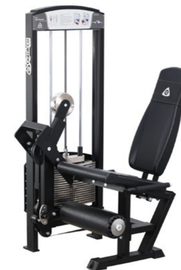
Leg Extension Adjustable Art.nr: 340R

Length: 95 cm Width: 99 cm Height: 162 cm