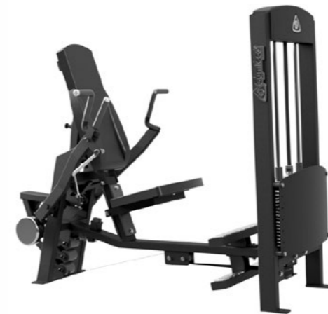
Dips Press / Shoulder Pull Art.nr: 354

Length: 174 cm Width: 85 cm Height: 136 cm