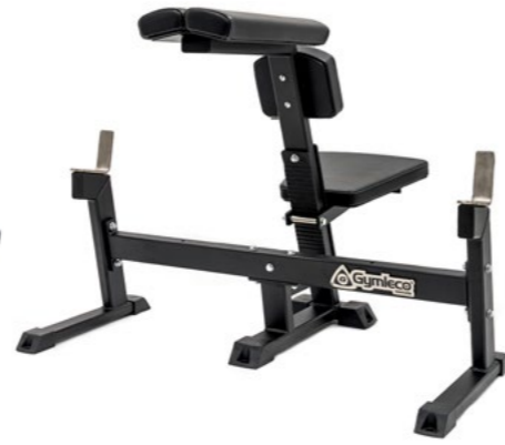
Seal Row Bench Open Model Art.nr: 118

Length: 112 cm Width: 125 cm Height: 90 cm