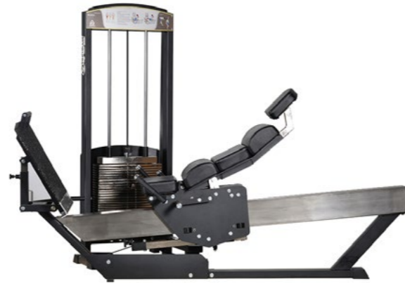
Seated Leg Press Art.nr: 343

Length: 221 cm Width: 116 cm Height: 162 cm