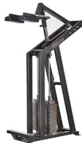
Standing Calf Press Art.nr: 347

Length: 130 cm Width: 60 cm Height: 180 cm