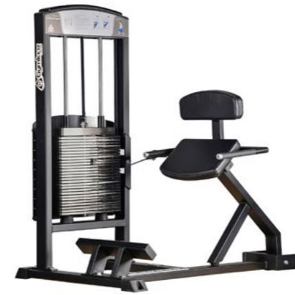
Seated Calf Press 45° Art.nr: 348

Length: 140 cm Width: 100 cm Height: 142 cm