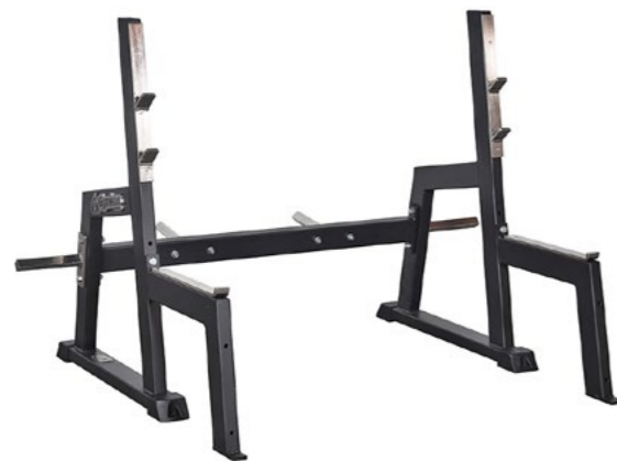
Lifting Rack for Decline Bench Art.nr: 154

Length: 125 cm Width: 170 cm Height: 110 cm