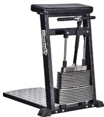
Forearm Curl Art.nr: 357

Length: 93 cm Width: 78 cm Height: 103 cm