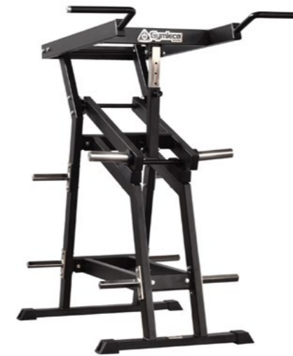
Viking Press Art.nr: 038

Length: 121 cm Width: 98 cm Height: 154 cm