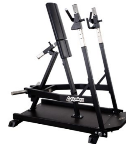
Standing Chest Press Art.nr: 028

Length: 152 cm Width: 100 cm Height: 163 cm