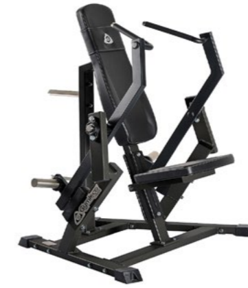
Iso Lateral Triceps Art.nr: 051

Length: 124 cm Width: 102 cm Height: 136 cm