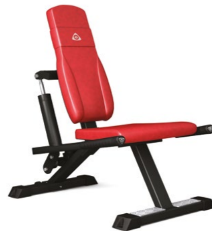
Shoulder Lift / Dips Art.nr: 954

Length: 105 cm Width: 77 cm Height: 117 cm Weight: 63 kg