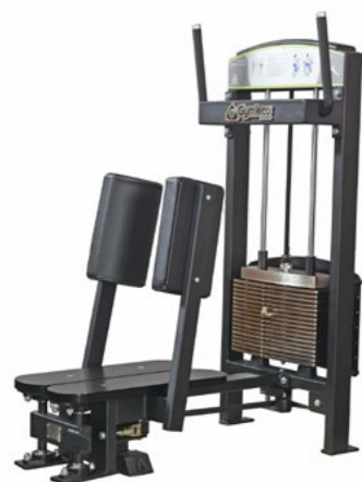
Standing Abductor Art.nr: 362

Length: 110 cm Width: 65 cm Height: 142 cm