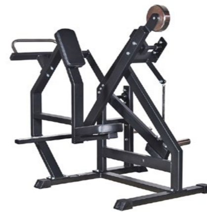
Gluteus, One Leg kick Art.nr: 060

Length: 126 cm Width: 119 cm Height: 133 cm