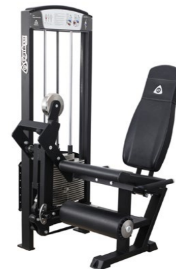
Leg Extension Art.nr: 340

Length: 95 cm Width: 99 cm Height: 162 cm