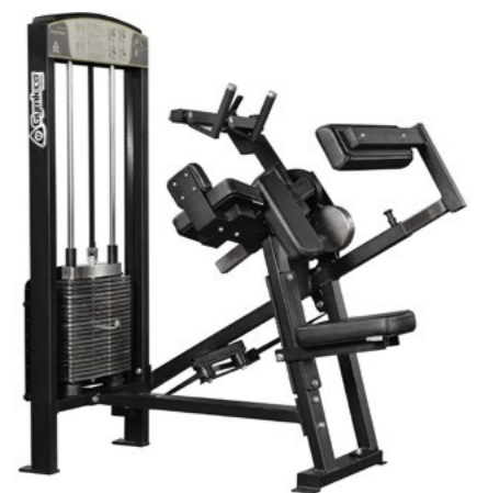
Biceps / Triceps Art.nr: 355

Length: 129 cm Width: 84 cm Height: 149 cm