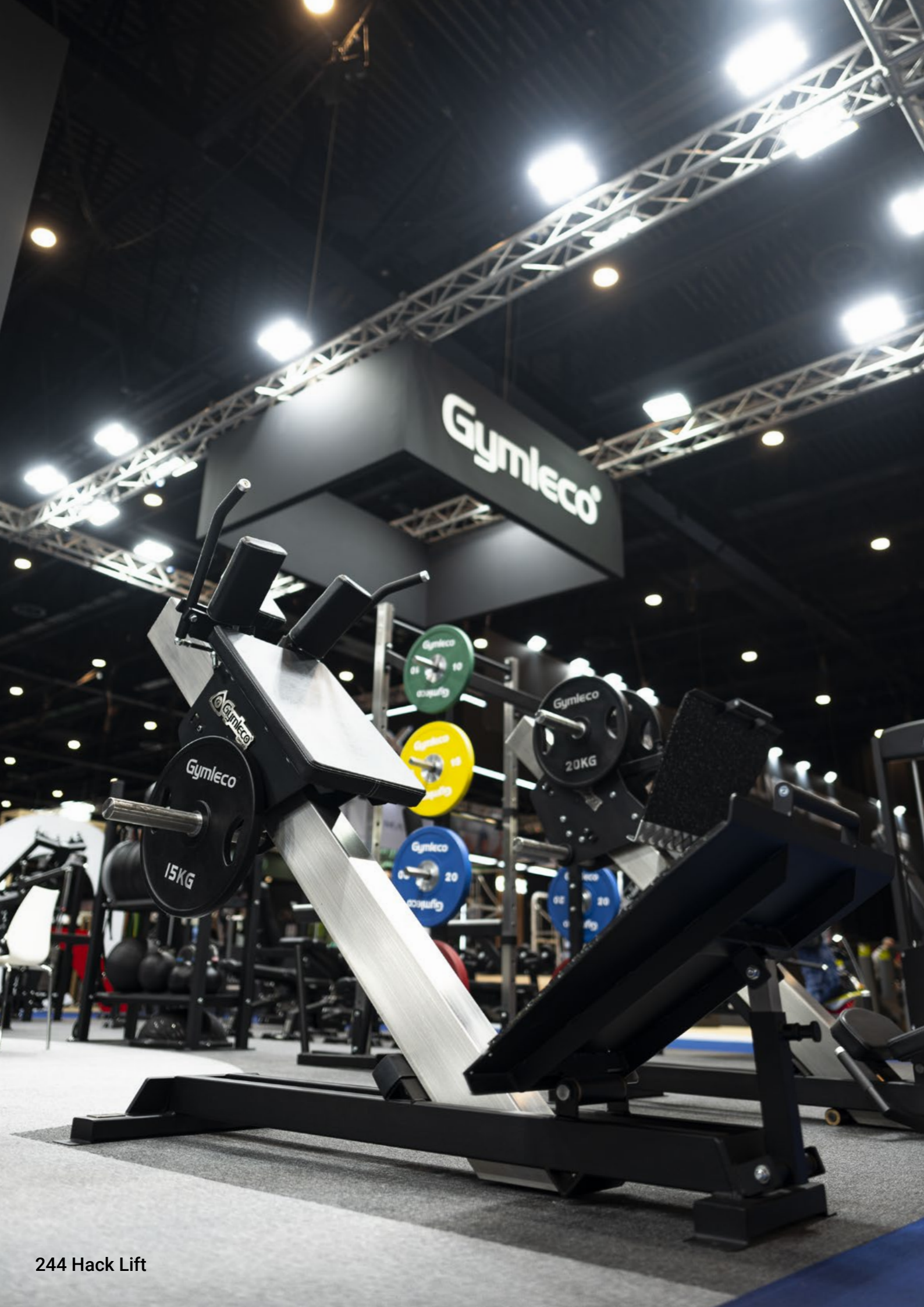
244 Hack Lift