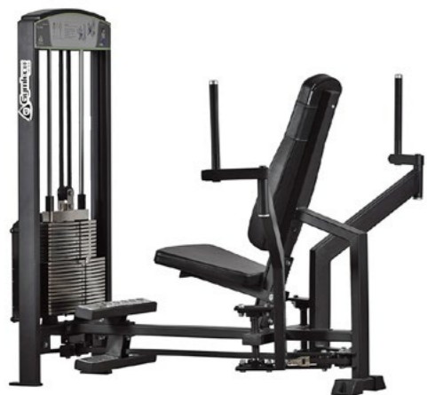
Seated Pec Deck Art.nr: 323

Length: 146 cm Width: 171 cm Height: 150 cm