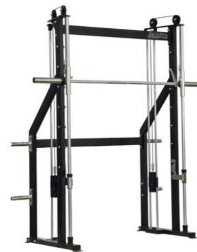
Smith Machine with counterweight Art.nr: 281

Length: 207 cm Width: 90 cm Height: 208 cm