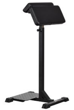
Standing Scott Curl Bench Art.nr: 152

Length: 63 cm Width: 53 cm Height: 92 cm