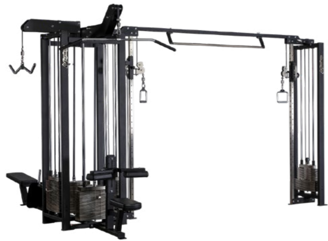
Multi gym /4 Station With Cable Cross Art.nr: 215K

Length: 410 cm Cable Cross: 80 kg x 2 Width: 323 cm Row: 120 kg Height: 235,5 cm Pulldown: 120 kg Weight N.W: 762 kg Triceps: 60 kg