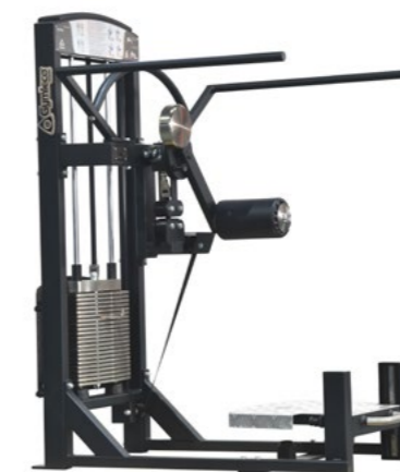
Multihip Art.nr: 369

Length: 115 cm Width: 110 cm Height: 160 cm