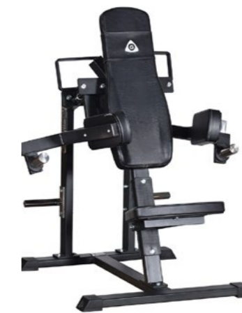
Shoulder Rotation Art.nr: 031

Length: 105 cm Width: 114 cm Height: 135 cm