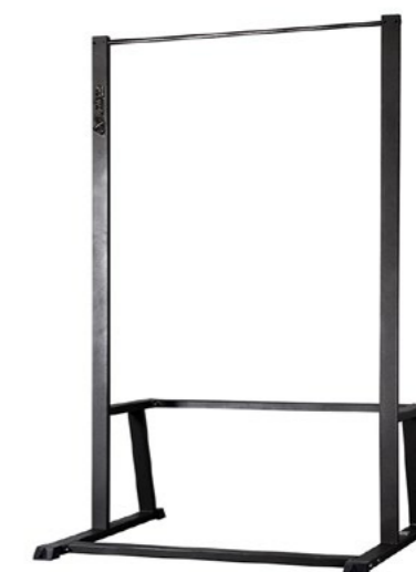
Standing Chins Rack Art.nr: 111

Length: 123 cm Width: 145 cm Height: 237,5 cm