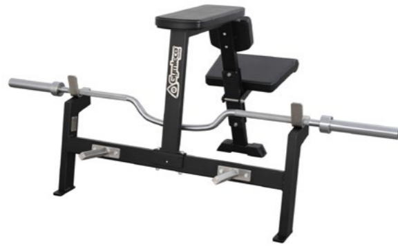
Seal Row Bench Art.nr: 117

Length: 147 cm Width: 122,5 cm Height: 91 cm