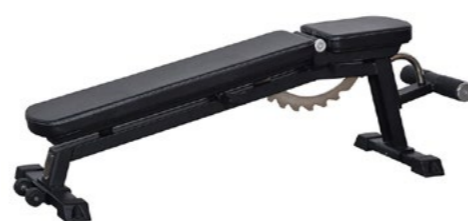
Adjustable Decline Bench Art.nr: 193

Length: 133 cm Width: 45 cm Height: 42 - 115 cm