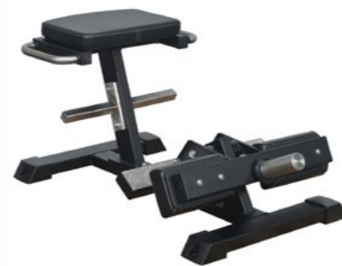
Tibia Dorsi Flexion Art.nr: 047

Length: 102 cm Width: 60 cm Height: 51 cm