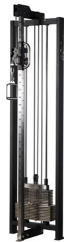
Half of a Cable Cross Art.nr: 225B

Length: 48 cm Width: 58 cm Height: 225 cm