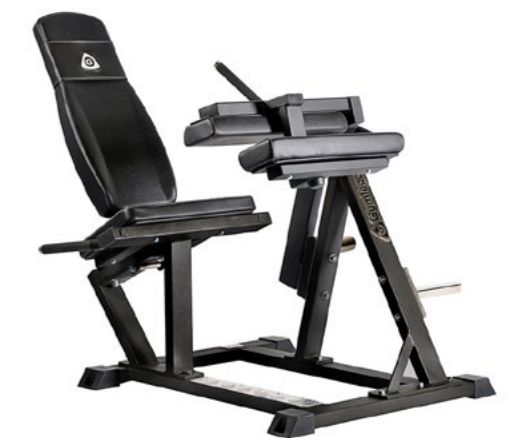
Seated Leg Curl Art.nr: 041

Length: 125 cm Width: 100 cm Height: 110 cm