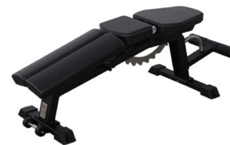
Adjustable Dumbbell Exercise Bench Art.nr: 193V

Length: 130 cm Width: 53 cm Height: 27-115 cm