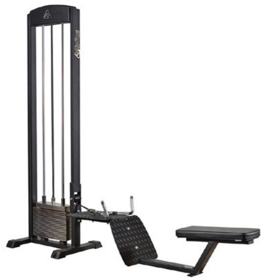
Seated Row Art.nr: 210

Length: 235 cm Width: 67 cm Height: 215 cm