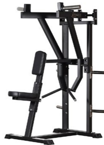
Iso Lateral Low Row Art.nr: 012

Length: 120 cm Width: 112 cm Height: 174 cm