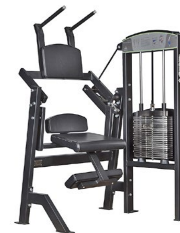
Seated Abs machine Art.nr: 370

Length: 170 cm Width: 101 cm Height: 104 cm