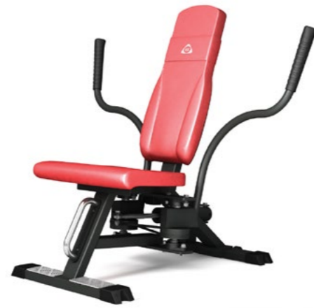
Pec Dec/ Rear Deltoid Shoulder Art.nr: 935

Length: 101 cm Width: 76 cm Height: 124 cm Weight: 43 kg