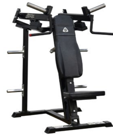
Shoulder Press Art.nr: 030

Length: 130 cm Width: 114 cm Height: 149 cm