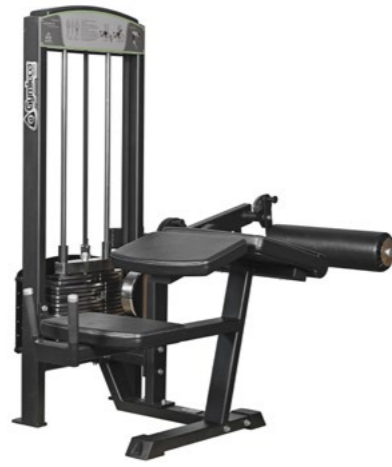
Lying Leg Curl, Adjustable Art.nr: 342R

Length: 170 cm Width: 97 cm Height: 149 cm