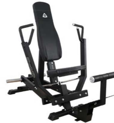
Seated Chest Press Art.nr: 021

Length: 176 cm Width: 114 cm Height: 140 cm