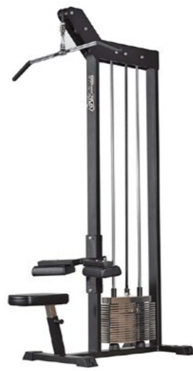
Lateral Pulldown Art.nr: 211

Length: 124 cm Width: 52 cm Height: 226 cm