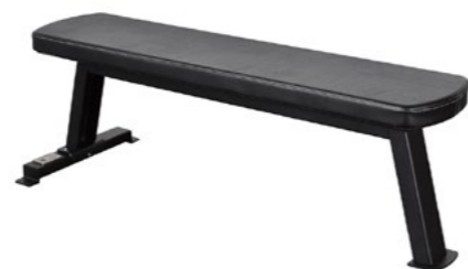
Fixed Flat Bench Art.nr: 191

Length: 123 cm Width: 45 cm Height: 38 cm