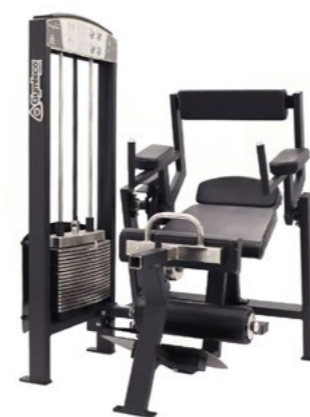
Lumbar/Abdominal (with armrest) Art.nr: 365B

Length: 100 cm Width: 90 cm Height: 160 cm