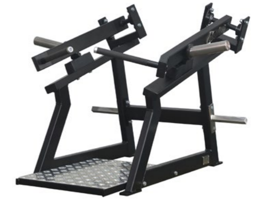
Upright Row Art.nr: 032

Length: 120 cm Width: 140 cm Height: 94 cm