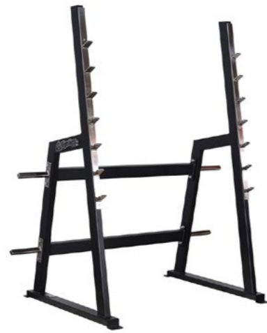
Squat Rack Art.nr: 148

Length: 162 cm Width: 100 cm Height: 186 cm