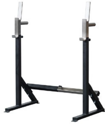
Bench Press and Squat Rack Art.nr: 142

Length: 60 Width: 45-125 cm Height: 79,5 - 162,5 cm