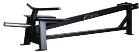
T-bar Row Art.nr: 115

Length: 206 cm Width: 86 cm Height: 47 cm