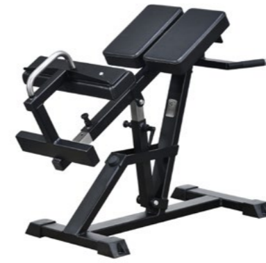
Back Raise, Adjustable 45-90 degrees Art.nr: 162

Length: 102 cm Width: 60 cm Height: 117 cm