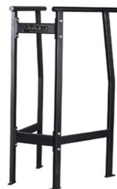
Dip Press stand Art.nr: 155

Length: 80 cm Width: 80 cm Height: 140 cm