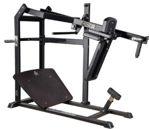
Pendulum Squat Art.nr: 045

Length: 195 cm Width: 108 cm Height: 161 cm