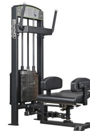
Kneestanding Abdominal Art.nr: 376

Length: 95 cm Width: 65 cm Height: 125 cm