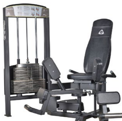
Adductor/Abductor Art.nr: 364

Length: 130 cm Width: 86 cm Height: 137 cm