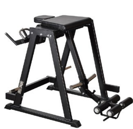
Reverse Hyper Pendulum Art.nr: 063

Length: 137 cm Width: 133,5 cm Height: 111 cm