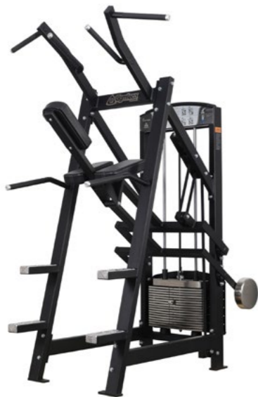
Chins /Dips Art.nr: 314

Length: 126 cm Width: 120 cm Height: 200 cm