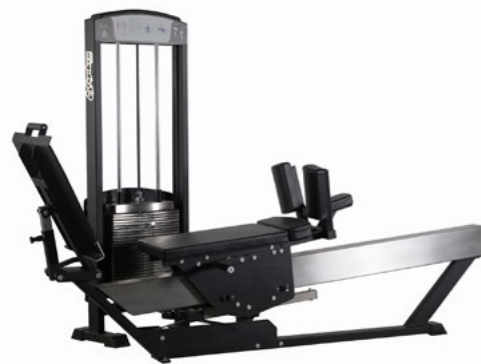
Horizontal Lying Leg Press Art.nr: 344 NEW!

Length: 221 cm Width: 116 cm Height: 162 cm