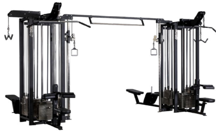
Multigym /8 Station With Cable Cross Art.nr: 215DK

Length: 410 cm Cable Cross: 80 kg x 2 Width: 323 cm Row: 120 kg Height: 235,5 cm Pulldown: 120 kg Weight N.W: 762 kg Triceps: 60 kg