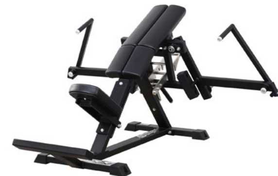
Incline Pec Fly Art.nr: 023

Length: 160 cm Width: 165 cm Height: 90 cm