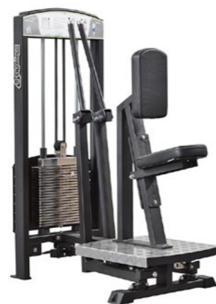
Rear Deltoid Shoulder Art.nr: 333

Length: 147 cm Width: 70 - 174 cm Height: 149 cm