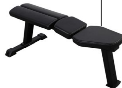
Fixed Dumbbell Exercise Bench Art.nr: 191V

Length: 110,7 cm Width: 52,4 cm Height: 43 cm