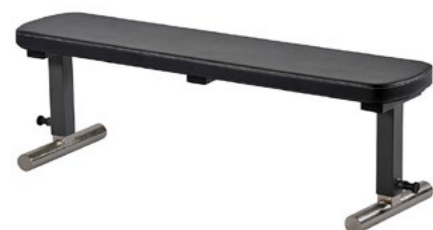
Adjustable Flat Bench Art.nr: 192

Split backrest maximizes exercises such as dumbbell flies