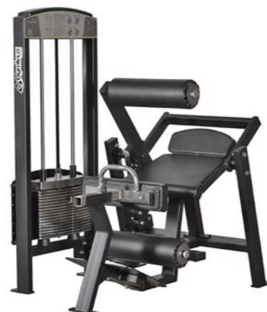
Lumbar/Abdominal Art.nr: 365A

Length: 100 cm Width: 90 cm Height: 160 cm