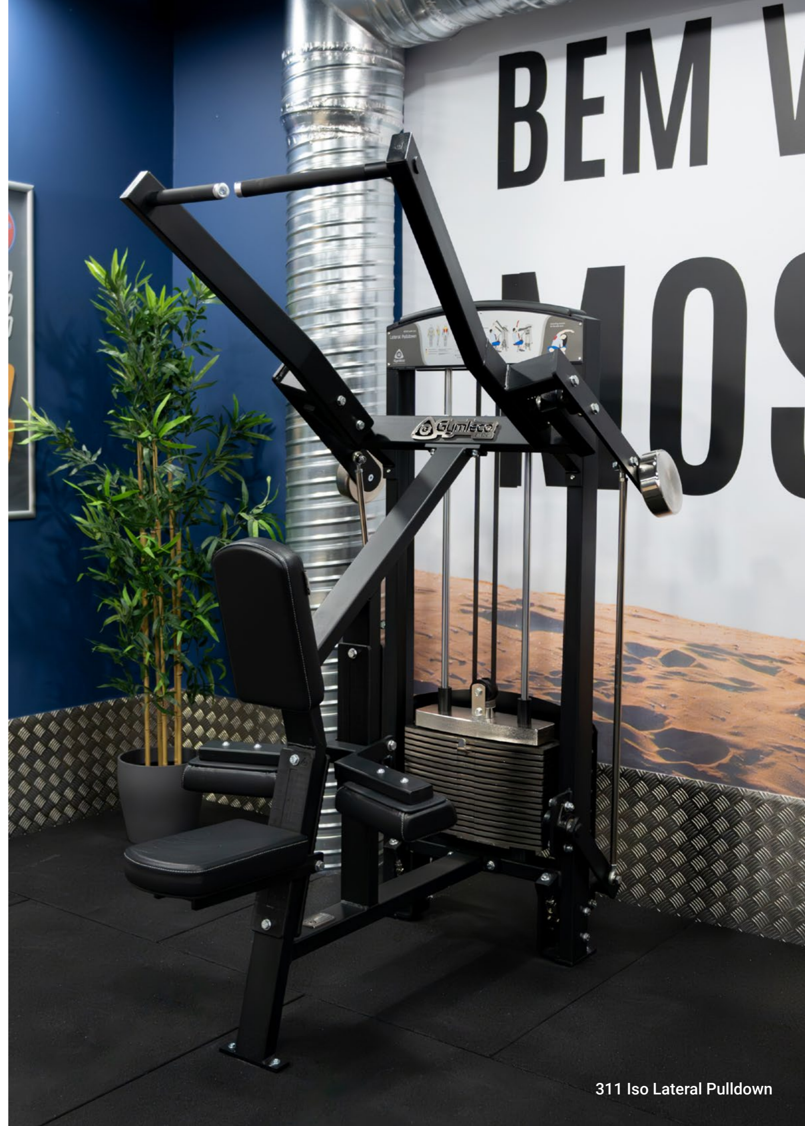
311 Iso Lateral Pulldown