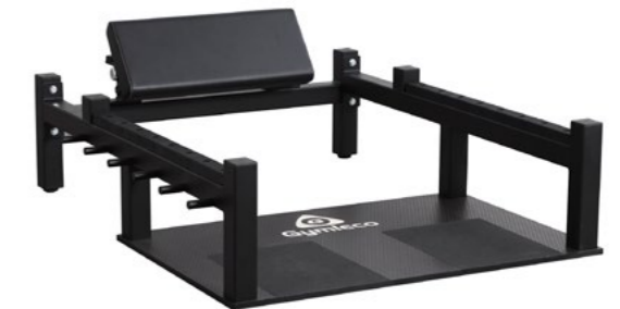
Glute Bridge Art.nr: 167

Length: 135 cm Width: 105 cm Height: 47 cm