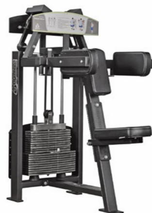
Shoulder Rotation Art.nr: 331

Length: 87 cm Width: 75 cm Height: 135 cm