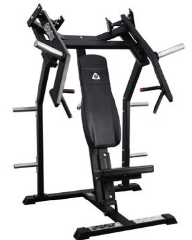
Incline Press / Chest Flyes Art.nr: 029

Length: 100 cm Width: 127 cm Height: 170 cm