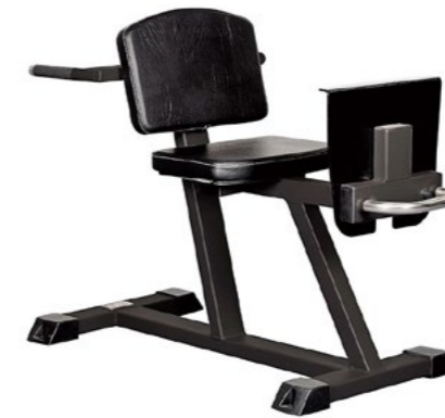
Knee standing Back Raise Art.nr: 163

Length: 105 cm Width: 59 cm Height: 79 cm