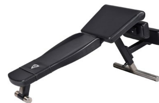
Adjustable Decline Bench Art.nr: 194R

Length: 148 cm Width: 60 cm Height: 60 cm