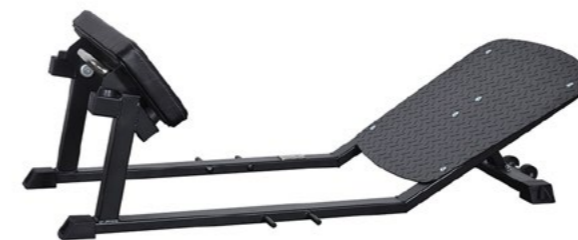
Hip Thrust bench Art.nr: 166

Length: 150 cm Width: 73 cm Height: 50 cm