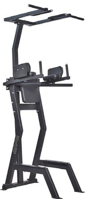
Leglift with Chins and Dips Art.nr: 179

Length: 70 cm Width: 91 cm Height: 227 cm