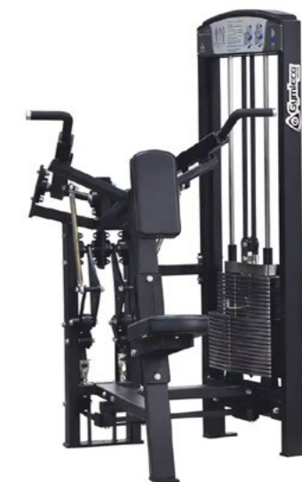
Shoulder Front Press Art.nr: 336

Length: 120 cm Width: 110 cm Height: 165 cm