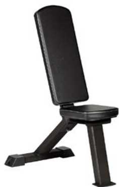
Fixed Bench 70° Art.nr: 153

Length: 76 cm Width: 40 cm Height: 90 cm