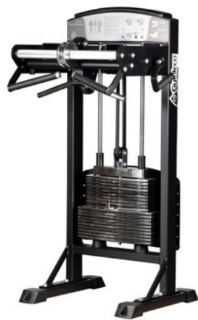
Forearm machine Art.nr: 356

Length: 61 cm Width: 75 cm Height: 136 cm