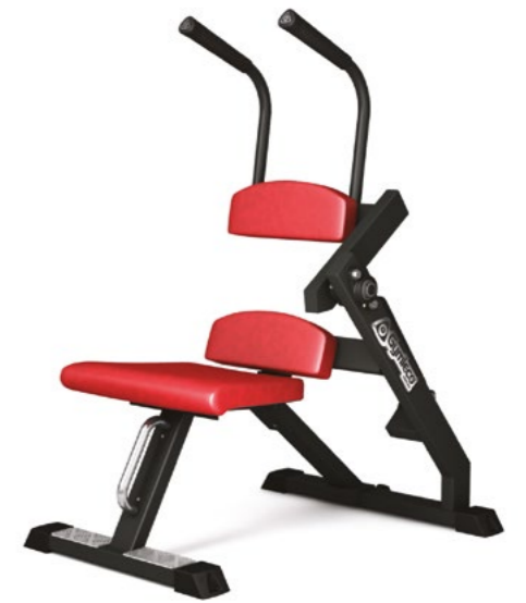
Abs / Lower Back Art.nr: 965

Length: 133 cm Width: 74 cm Height: 112 cm Weight: 56 kg