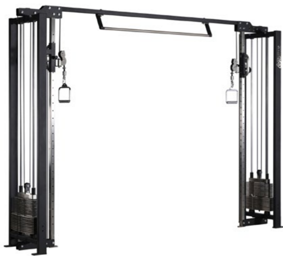
Cable Crossover Multigym Art.nr: 225

Length: 308 cm Width: 58 cm Height: 225 cm